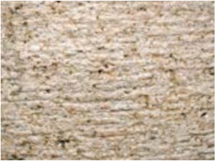
COARSE ADZE min thickness - 2" / 50 mm