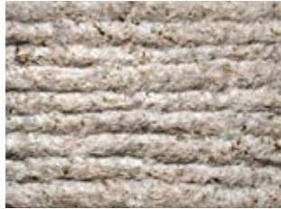
2 POINT STALK min thickness - 1.5" / 38 mm