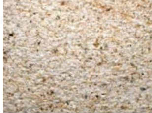
FINE ADZE min thickness - 1.5" / 38 mm