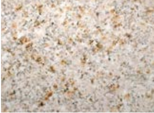
HONED min thickness - 0.75" / 20 mm