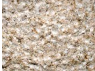
PINEAPPLE min thickness - 3" / 75 mm