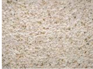
BUSH HAMMER min thickness - 1.5" / 38 mm