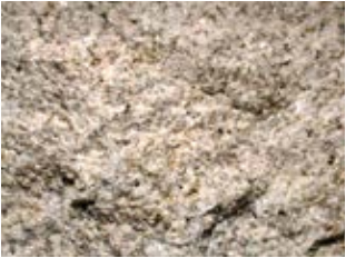
SPLIT min thickness - 3" / 75 mm