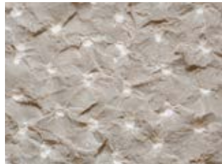
PINEAPPLE min thickness - 3" / 75 mm