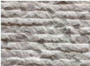
2 POINT STALK min thickness - 1.5" / 38 mm