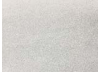
SANDBLASTED min thickness - 0.75" / 20 mm