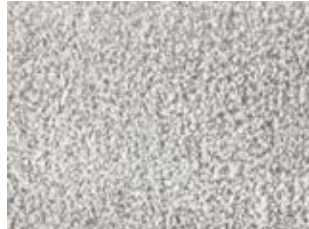
BUSH HAMMER min thickness - 1.5" / 38 mm