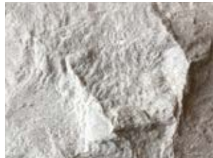
SPLIT min thickness - 3" / 75 mm