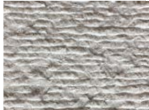
4 POINT STALK min thickness - 1.5" / 38 mm