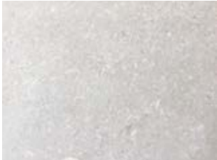
HONED min thickness - 0.75" / 20 mm