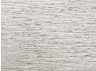
FINE ADZE min thickness - 1.5" / 38 mm