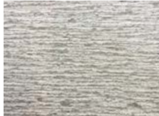
COARSE ADZE min thickness - 2" / 50 mm