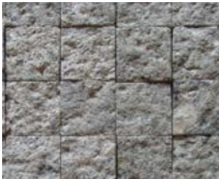
POOL TILES min thickness - 0.5" / 13 mm