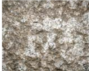
TEXTURE SAMPLE #2