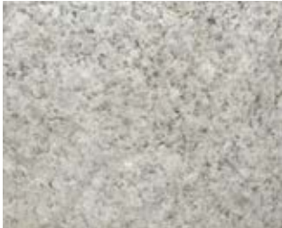
TEXTURE SAMPLE #1